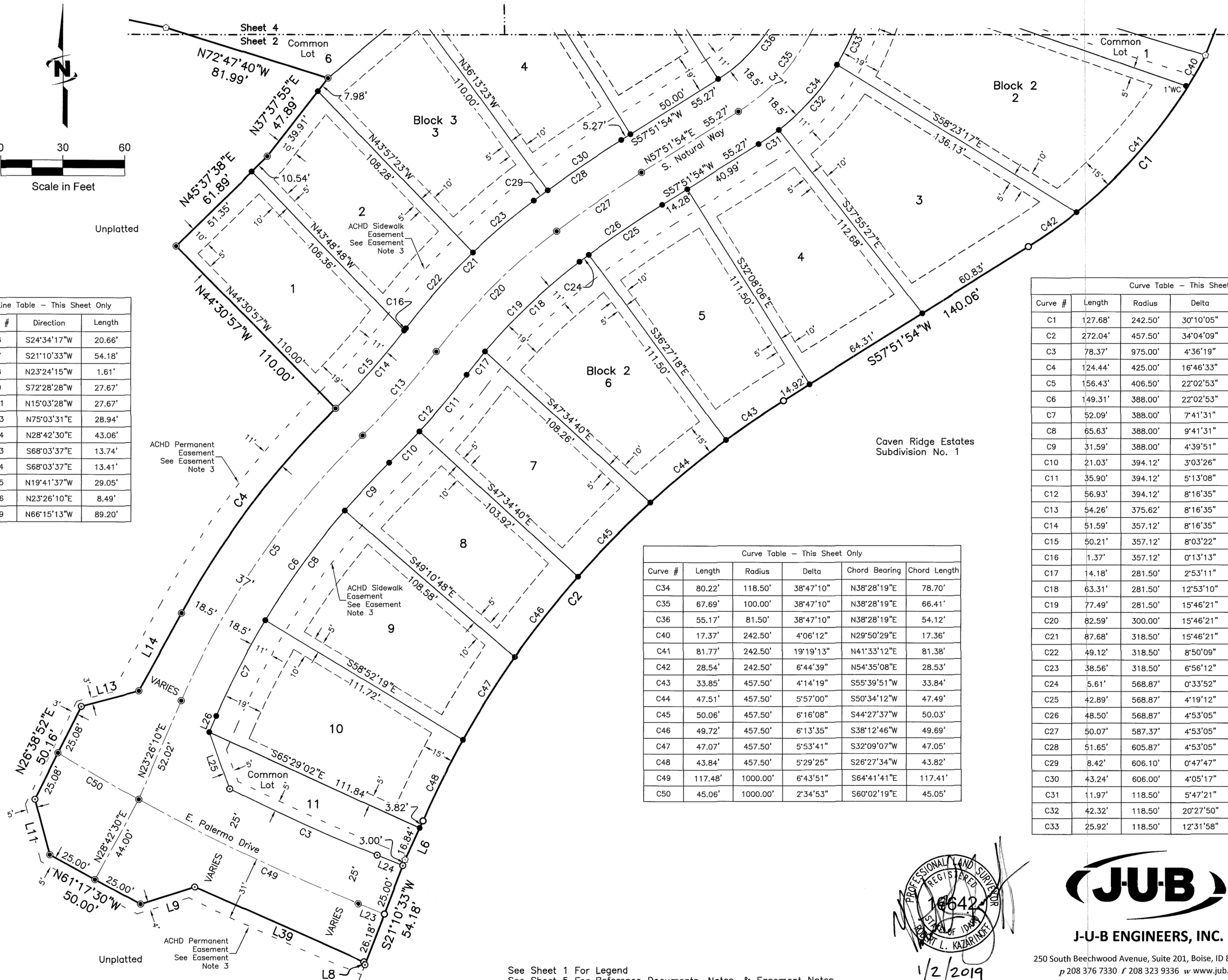
Curve Table - This Sheet Only